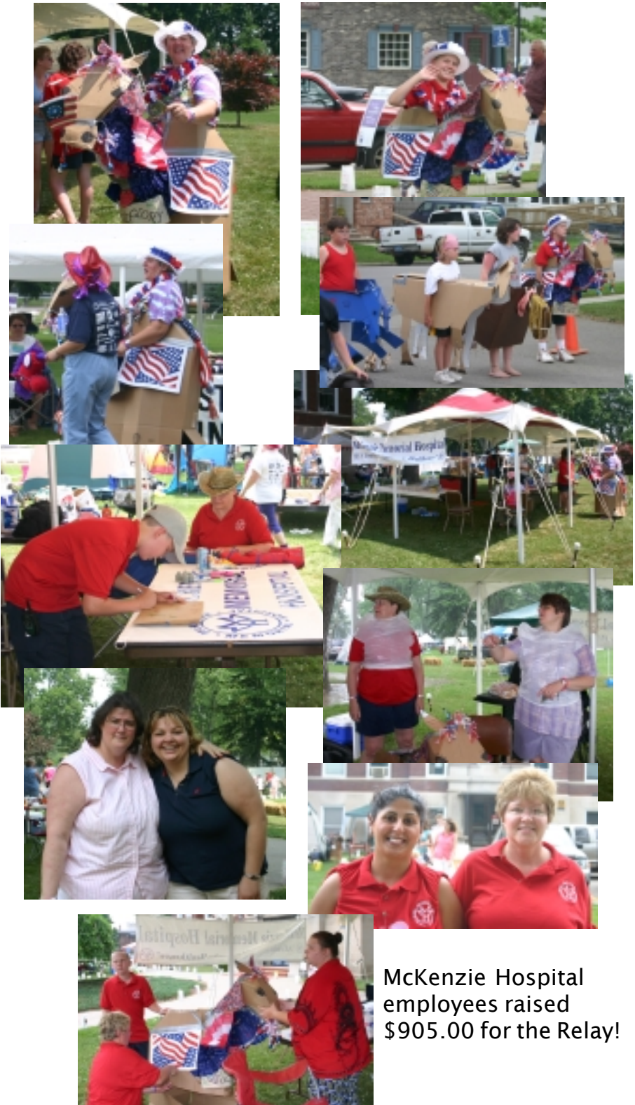
McKenzie Hospital employees raised $905.00 for the Relay!